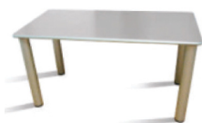
COD. 06881 "Millerighe" desk table 140x70xH73 cm