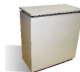
COD. 06747 "Spring" reception desk 95x50xH100 cm