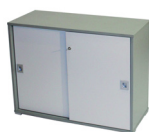
COD. 06829 "Fly" showcase 95x45xH73 cm