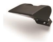
COD. 09005 "Prisma" spotlight 300 W